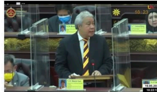
Awg Tengah tabling the Forests (Amendment) Bill 2022 today (May 19, 2022) in DUN. Screenshot of Ukas Iwaswam.