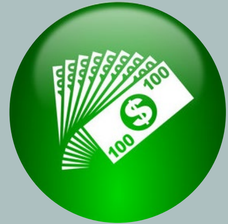
FEES AND ROYALTY