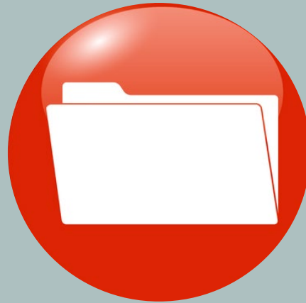
PERMIT AND LICENCING